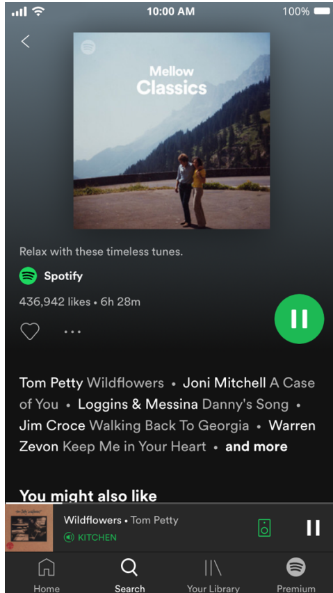
Spotify (Free version) Mellow Classics Now Playing Screenshot